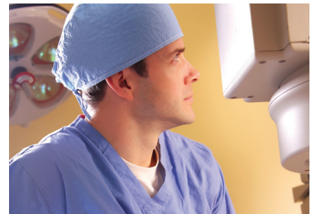
The Nautilus/Epson medical imaging and publishing system is a reliable and cost-effective solution for South Jersey Healthcare.

Epson Discproducer Disc Publisher Nautilus Medical AutoRay System