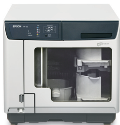
Epson's Discproducer disc publisher is built with Epson's world-renowned robotics and printing technologies.